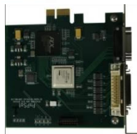
PnP Innovations SpaceWire Based PnP Interface Card